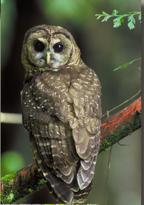
Northern Spotted Owl