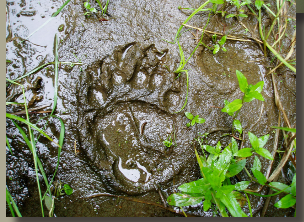
Black Bear Paw Track