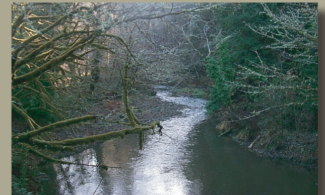
South Fork Elk River

The 7,474-acre Reserve is managed for the public by the U.S. Department of the Interior, Bureau of Land Management (BLM) and the California Department of Fish and Game. The Humboldt County land was acquired for public ownership on March 1, 1999 from private owners.